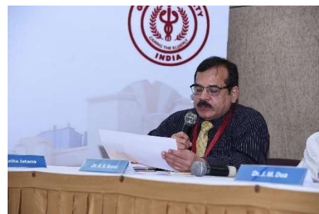
Free Paper Judges