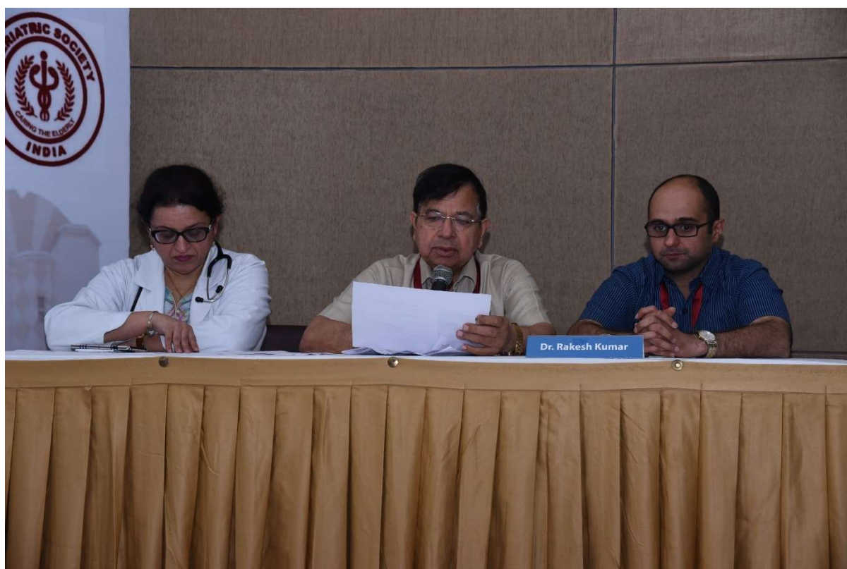
Delegates interacted with speakers even during lunch & evening tea breaks.